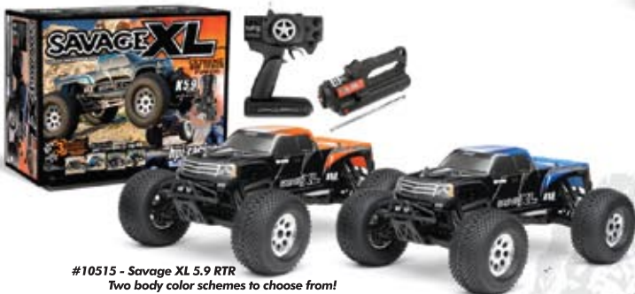
#10515 - Savage XL 5.9 RTR Two body color schemes to choose from!

The XL uses aluminum extending axles with 17mm hex hubs. These are lightweight and tough, and fit any 17mm hex monster truck or truggy type wheel, so your collection of monster truck wheels are perfectly usable!