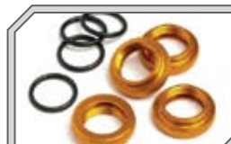
86839 ALUMINUM PRELOAD COLLAR 13mm (4sets)

Precision machined from high quality aluminum and hard anodized to a tough and ultra fine finish, these shock bodies will smooth out any jump you throw at your E-Firestorm Flux!