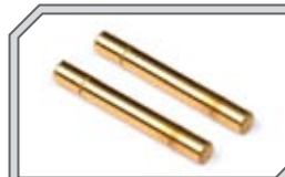
86844 TITANIUM NITRIDE STEERING POST 3x23mm (2pcs)

Titanium nitride coatings help prevent corrosion and substantially improve the smoothness of the shafts, helping you reduce your maintenance times as well as the lifetime of the shafts!