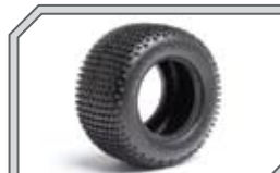
4411 GROUND ASSAULT TIRE S COMPOUND (2.2in/2pcs)

Titanium nitride coatings help prevent corrosion and substantially improve the smoothness of the shafts, helping you reduce your maintenance times as well as the lifetime of the shafts!