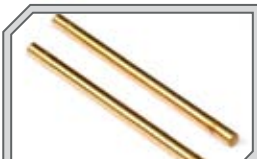
86847 Titanium Nitride Suspension Shaft 3x54mm (2pcs)

Titanium nitride coatings help prevent corrosion and substantially improve the smoothness of the shafts, helping you reduce your maintenance times as well as the lifetime of the shafts!