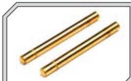
86848 Titanium Nitride Suspension Shaft 3x33mm (2pcs)

Titanium nitride coatings help prevent corrosion and substantially improve the smoothness of the shafts, helping you reduce your maintenance times as well as the lifetime of the shafts!