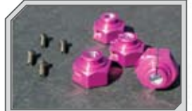
86300 ALUMINUM HEX HUB CLAMP TYPE 12mm (PURPLE/4pcs)

Optional Pinion Gears 6917 Pinion Gear 17 Tooth (48 PITCH) 6918 Pinion Gear 18 Tooth (48 PITCH) 6919 Pinion Gear 19 Tooth (48 PITCH) 6920 Pinion Gear 20 Tooth (48 PITCH) 6921 Pinion Gear 21 Tooth (48 PITCH)