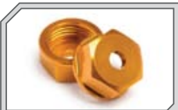
86841 ALUMINUM BOTTOM SHOCK CAP (2pcs)

HPI genuine spare part for E-Firestorm 10T Flux aluminum shock sets.