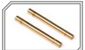
86845 Titanium Nitride Suspension Shaft 3x32mm (2pcs)

Prep your E-Firestorm for the roughest conditions with Titanium Nitride Steering Posts! Titanium nitride coatings help prevent corrosion and substantially improve the smoothness of the shafts.