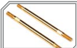
86842 TITANIUM NITRIDE COATED SHOCK SHAFT 3x50mm (2pcs)

HPI genuine spare part for E-Firestorm 10T Flux aluminum shock sets.