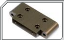
86831 Aluminum Front Suspension Arm Mount

We offer a wide range of option parts to maximize the speed and performance of the E-Firestorm 10T Flux. Visit our website for a complete list of parts at www.hpiracing.com