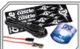
100573 CASTLE LINK USB PROGRAMMING KIT

Tune your HPI Flux ESC through your Windows PC! You can adjust brake / reverse settings, battery cut-off voltage and motor type, throttle 'punch' control, drag brake, motor timing and more!