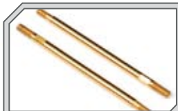
86843 TITANIUM NITRIDE COATED SHOCK SHAFT 3x58mm (2pcs)

Titanium nitride coatings help prevent corrosion and substantially improve the smoothness of the shafts, helping you reduce your maintenance times as well as the lifetime of the shafts!