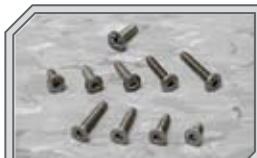
Z056 TITANIUM TP BINDER HEAD SCREW M3 x8mm (HEX / 5pcs)

Enjoy the decreased rotational weight and reinforced sidewall construction of these serious dirt grippers! They also deliver quicker acceleration, more traction and sharper cornering.