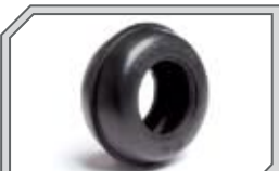
4457 SAND RUNNER TIRE D COMPOUND (2.2in/2pcs)

Now you can take any 2.2-inch wheel equipped vehicle to the dunes and throw huge loads of sand just like the real sand rails!