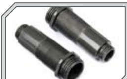
86837 ALUMINUM THREADED SHOCK BODY (67-87mm/2pcs)

Tune your HPI Flux ESC through your Windows PC! You can adjust brake / reverse settings, battery cut-off voltage and motor type, throttle 'punch' control, drag brake, motor timing and more!