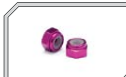
Z678 ALUMINUM THIN LOCK NUT M4 (PURPLE/5pcs)