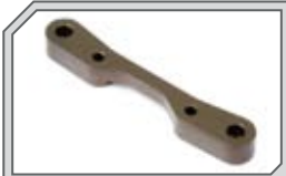
86832 Aluminum Front Arm Brace

Constructed of ultra tough aluminum and hard anodized for great looks and even greater toughness!