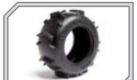
4412 SAND THROWER TIRE D COMPOUND (2.2in/2pcs)

Ground Assault tires feature square pins for durability and high grip. The rounded contour allows consistent traction on uneven surfaces, high grip in the corners, and low resistance on straights.