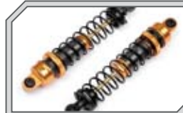
87251 ALUMINIUM THREADED SHOCK SET (67-87mm/2pcs) 87252 ALUMINIUM THREADED SHOCK SET (70-103mm/2pcs)

Increase the durability of your truck with our Aluminum Rear Hub Carriers! Precision machined from billet 7075 aluminum and hard anodized for extra strength and great looks.