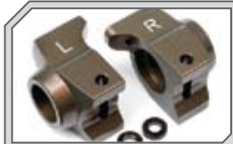
87256 ALUMINUM REAR HUB CARRIER SET (0 Degree)

Constructed of ultra tough aluminum and hard anodized for extra toughness, this is just the part to keep your E-Firestorm Flux bashing long after the competition has given up.