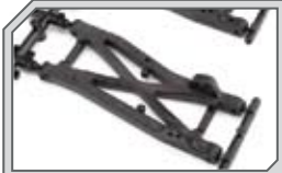
100409 COMPOSITE REAR SUSPENSION ARM SET

Long-fiber composite strands are used for extra reinforcement, making them significantly stiffer than the stock nylon parts for quicker and more accurate suspension response.