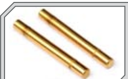
86846 Titanium Nitride Suspension Shaft 3x27mm (2pcs)

These titanium nitride coated shafts are stronger than standard steel pins for added durability and reduced friction, providing smoother suspension movement for faster lap times.