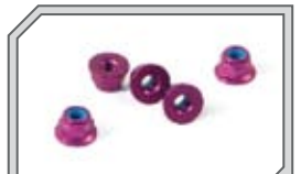
Z679 WHEEL NUT M4 (PURPLE/5pcs)