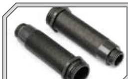
86838 ALUMINUM THREADED SHOCK BODY (70-103mm/2pcs)

Precision machined from high quality aluminum and hard anodized to a tough and ultra fine finish, these shock bodies will smooth out any jump you throw at your E-Firestorm Flux!