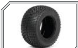
4860 Dirt Bonz Tire S Compound (57x50mm 2.2in / 2pcs)

Molded in HPI's exclusive D Compound, Sand Runner front tires have a major rib down the center to cut through the sand for stable steering.