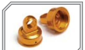
86840 ALUMINUM SHOCK CAP (2pcs)

HPI genuine spare part for E-Firestorm 10T Flux aluminum shock sets.