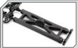
100408 COMPOSITE FRONT SUSPENSION ARM SET

86914 13x5x1.1mm 12coils (3.0lb, Pink) 86915 13x5x1.1mm 13coils (2.7lb, Silver) 86916 13x5x1.1mm 14.5coils (2.4lb, Blue)