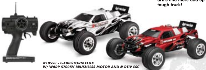
#10553 - E-FIRESTORM FLUX W/ WARP 5700KV BRUSHLESS MOTOR AND MOTIV ESC