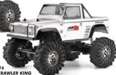
102116 RTR CRAWLER KING WITH LAND ROVER DEFENDER 90 BODY