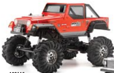
102115 RTR CRAWLER KING WITH JEEP® WRANGLER® RUBICON BODY