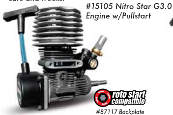
#15105 Nitro Star G3.0 Engine w/Pullstart

5.5mm Rotary Carb., ABC, SG Shaft, Side Exhaust, Heatsink Head, Black Crank Case. This is the standard powerplant for the Firestorm stadium truck and an easy upgrade for SG shaft cars and trucks.