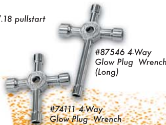
#87546 4-Way Glow Plug Wrench (Long)