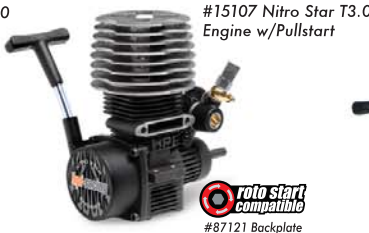
#15107 Nitro Star T3.0 Engine w/Pullstart

6.5mm Rotary Carb., ABC, Standard Shaft, Side Exhaust, Heatsink Head, Black Crank Case. Powering the RTR NITRO RS4 3 EVO+, the T3.0 is an easy upgrade for cars and trucks equipped with the T-15 engine.