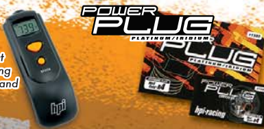
#74151 HPI Racing Temp Gun

HPI Power Plugs use a unique blend of platinum and iridium metals for high performance, long plug life, and consistent tuning.