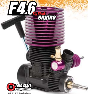
F4.6 Big Block engine