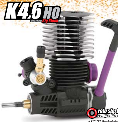
K4.6 HO high output Big Block

#1495 Nitro Star F4.6 Engine w/Pullstart The F4.6 is the powerplant responsible for the immense speed and raw torque of the Savage X 4.6, and now it's available to fit into any Savage or big-block monster truck!