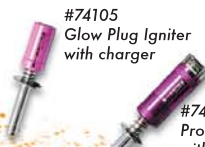
#74105 Glow Plug Igniter with charger