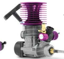
F4.1 BIG BLOCK

#15201 Nitro Star K4.6 Engine w/Pullstart Rated at 2.9 horsepower. Features a machined billet aluminum heatsink head for extra cooling, true ABC chrome sleeve construction for durability, and a three needle 8.5mm slide carburetor with a composite body for better performance at higher temperatures.