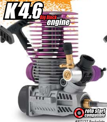
K4.6 Big Block engine

#15204 Nitro Star K4.6 HO Engine w/Pullstart The HPI Nitro Star K4.6 HO engine is the high output (HO) version of the well known HPI Nitro Star K4.6 engine. The high output version is optimized for even more RPM making it the ultimate big block engine for the Hellfire and single speed transmission trucks.