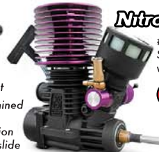
Nitro Star S-25

#1408 Nitro Star F4.1 Engine w/Pullstart roto start compatible #87117 Backplate