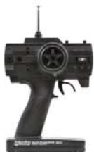
#10550 RTR E-FIRESTORM 10T W/DSX-2 TRUCK BODY