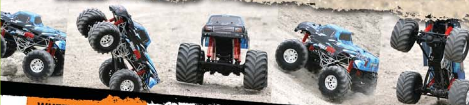
WHEELY KING 4x4

It's got the power you need to pull wheelies and gets you out of the rough stuff with ease.