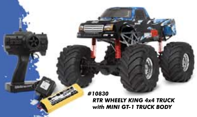
#10830 RTR WHEELY KING 4x4 TRUCK with MINI GT-1 TRUCK BODY