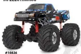
#10836 10836 WHEELY KING 4x4 TRUCK with MINI GT-1 TRUCK BODY (no electronics)