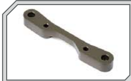
86832 Aluminum Front Arm Brace

Machined from strong aluminum and hard anodized for extra strength and great looks.