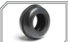
4457 Sand Runner Tire D Compound (2.2in/102x53mm/Front)

Designed to bring more power to the table and polished for great looks, this pipe fits the existing header on any of our vehicles with left side exhausts and .15 or higher nitro engines.