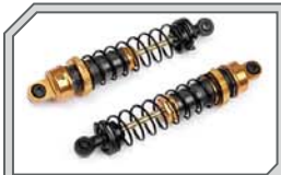
87252 Aluminum Threaded Shock Set (70-103mm/2pcs)

Tough, precision-machined anodized aluminum for increased durability. Aluminum preload collars for fast and easy ride height adjustment.