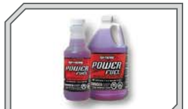
74318 HPI Power Fuel 20% (1 quart)