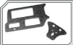
73819 Graphite Upper Deck Set

We offer a wide range of option parts to maximize the speed and performance of the Firestorm 10T. Visit our website for a complete list of parts at www.hpiracing.com