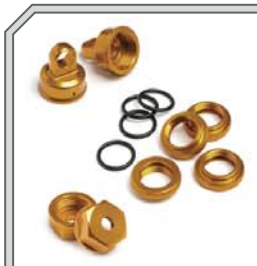
86839 Aluminum Preload Collar 13mm (4 sets)