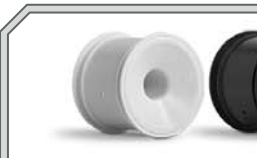
3090 Dish Wheel White 3091 Dish Wheel Black 3092 Dish Wheel Yellow

Firestorm option color body, decaled and trimmed.