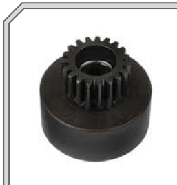
77137 Clutch Bell 17 Tooth (0.8M)

Precision machined from high quality aluminum and hard anodized to a tough and ultra fine finish, these shock bodies will smooth out any jump you throw at your Firestorm!