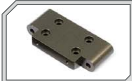
86831 Aluminum Front Suspension Arm Mount

Increase the stiffness of the chassis and cut the weight of the truck for faster acceleration, improved handling and lower lap times.