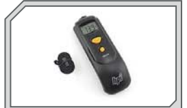
74151 HPI Racing Temp Gun

The perfect upgrade for racers, you can now increase the durability of your Firestorm with this set of Aluminum Rear Hub Carriers!