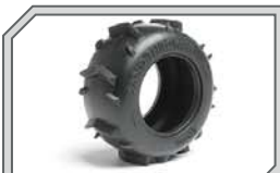
4412 Sand Thrower Tire D Compound (2.2in/102x53mm/Rear)

The perfect front tire for running your 2WD truck in the sand. Use them in conjunction with HPI Sand Thrower paddle rear tires for maximum sand roosting performance.