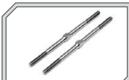
93485 Titanium Turnbuckle M3x69mm (2pcs)

Take any 2.2-inch wheel equipped vehicle to the dunes and throw huge roosts of sand just like the real sand rails. You can also run them in loose dirt and even in the mud!