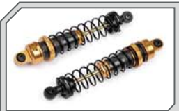
87251 Aluminum Threaded Shock Set (67-87mm/2pcs)

Our team drivers use it as a serious diagnostic tool to tune their nitro engines and electric motors for maximum performance.