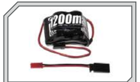
2012 Hump Battery Pack for Receiver (6V 1200mAh/Ni-MH)

Machined from strong aluminum and anodized for great looks.