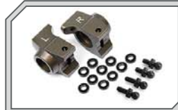
87256 Aluminum Rear Hub Carrier Set (0 Degree)

Machined from strong aluminum and hard anodized for extra strength and great looks