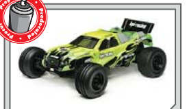
7781 DSX Panted Body (Black/Green)

This body is loaded with detail and molded in crystal clear polycarbonate so you can add your own custom paint job.