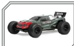
7123 DSX-1 Truck Body (Clear)

Made from Grade 5 Titanium, these turnbuckles save critical weight and are sized to fit the front & rear camber links, and they can also be used as steering links.