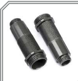
86837 Aluminum Threaded Shock Body (67-87mm/2pcs)

6 volts provides servos with maximum power, and 1200 milliamps gives racers the confidence they need for extremely long runs without running out of juice!