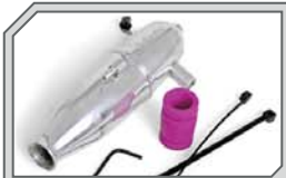
86161 MT 2 Aluminum Tuned Pipe

The Super Chassis is machined from a thick 2.5mm plate of aerospace quality 7075S aluminium, delivering increased chassis strength and rigidity for extreme driving conditions.