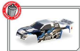
7761 Nitro MT-1 Truck Body Precut/Prepainted/Predecated (Blue/White/Grey)

Customize the look of your MT 2 by adding one of our prepainted bodies!