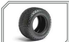
4410 Ground Assault Tire D Compound (2.2in/2pcs)

Nitro MT 2 Rear Springs (Not for original Nitro MT) 6590 Yellow 14x80x1.1mm 17 Coils (Soft) 6592 Black 14x80x1.1mm 16 Coils (Medium) 6593 Blue 14x80x1.1mm 15 Coils (Firm) 6594 Purple 14x80x1.1mm 14 Coils (Super Firm)