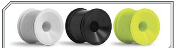
3090 Dish Wheel White 3091 Dish Wheel Black 3092 Dish Wheel Yellow

Made from our sticky S Compound rubber, these tires will grip almost any terrain! Our new Yokohama Geolandar M/T Tire will fit all 2.2" 1/10 scale truck wheels. Packaged in pairs.