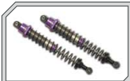
A718 Aluminum Threaded Super Shocks (70-103mm)

Allows fine tuning of camber settings. Titanium parts are stronger and lighter than the steel versions.