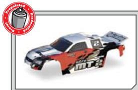
7760 Nitro MT-1 Truck Body Precut/Prepainted/Predecated (Red/White/Grey)

Customize the look of your MT 2 by adding one of our prepainted bodies!