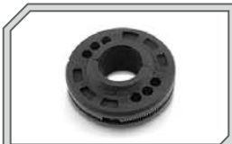
87191 Nitro Racing Clutch

Use this set of springs to adjust and fine-tune the gear diff of your car for different track conditions.