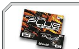
1502 Glow Plug Med R3 1503 Glow Plug Med Cold R4 1504 Glow Plug Cold R5

Rechargeable Ni-MH pack for longer run times.