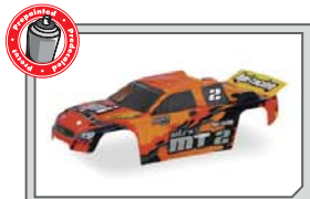
7759 Nitro MT-1 Truck Body Precut/Prepainted/Predecated (Orange/Yellow/Black)

For all-out racing, bashing or crawling, dish wheels deliver optimum stiffness and slick aerodynamics. The weight of the Dish Wheel is the perfect blend of minimal rotational mass for maximum speed while providing strength to withstand hard landings. The slick aero design also prevents dirt from getting into the wheels during heavy side-load braking.