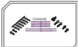
72227 Titanium Turnbuckle Set

Machined holes help keep the weight down for quick acceleration, and the holes also help keep the clutch shoes cooler for consistent performance.