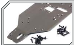
73948 Super Chassis 2.5mm (7075S / Gun Metal)

We offer a wide range of option parts to maximize the speed and performance of the Nitro MT 2 18SS+. Visit our website for a complete list of parts at www.hpiracing.com