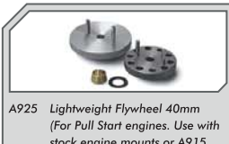
A925 Lightweight Flywheel 40mm (For Pull Start engines. Use with stock engine mounts or A915. Requires A804 Brass Collet)

The clutch has three adjustment holes so racers can choose the best setting for high or low traction racing surfaces, and change the range of RPMs that the clutch engages the clutchbell gear.