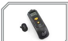
74151 HPI Racing Temp Gun

Our team drivers use it as a serious diagnostic tool to tune their nitro engines and electric motors for maximum performance.