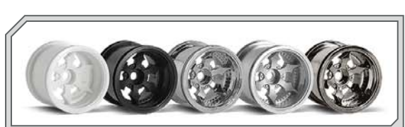
Customize your MT 2 with these additional colors for the Spike wheels! 3080 Spike Truck Wheels White 3081 Spike Truck Wheels Black 3082 Spike Truck Wheels Shiny Chrome 3083 Spike Truck Wheels Matte Chrome 3084 Spike Truck Wheels Black Chrome

Customize the look of your MT 2 by adding one of our prepainted bodies!