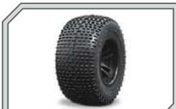
4860 Dirt Bonz Tire S Compound (57x50mm 2.2in / 2pcs)

Featuring a modern tread design for racing on hard-packed dusty surfaces and a sticky yet durable compound.