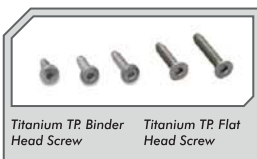
Titanium TP Binder Head Screw Titanium TP Flat Head Screw

Our team drivers use it as a serious diagnostic tool to tune their nitro engines and electric motors for maximum performance.