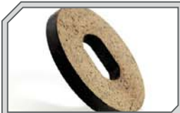
A844 Fiber Brake Disc

Now you can have power, strength and BLING in one shiny package. Designed to bring more power to the table and polished for great looks. This pipe fits the existing header.