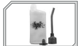
74115 HPI Fuel Bottle (500cc)

Keeping your air filter clean and oiled is essential for engine protection. The convenient 4oz spray can is perfect for pit boxes and features a precision nozzle for easy application.