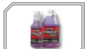
74318 HPI Power Fuel 20% (1 quart) 74320 HPI Power Fuel 30% (1 quart) 74348 HPI Power Fuel 20% (1 gallon) 74350 HPI Power Fuel 30% (1 gallon) Specially blended fuel for optimum engine performance and protection.