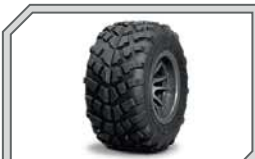
4456 Geolandar MT Tire S Compound

These tires deliver quicker acceleration, more traction and sharper cornering. Each package contains a pair of sticky S compound tires and a pair of high performance inner foams.