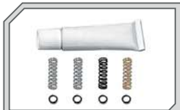
72215 Gear Diff Adjustment Springs (Med, Firm, Stiff)

This high capacity fuel bottle holds half of a quart of nitro so you can spend more time driving and less time refilling your fuel bottle. It's made from translucent polyethylene for durability.