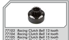
77103 Racing Clutch Bell 13 tooth 77104 Racing Clutch Bell 14 tooth 77105 Racing Clutch Bell 15 tooth 77106 Racing Clutch Bell 16 tooth 77107 Racing Clutch Bell 17 tooth 77108 Racing Clutch Bell 18 tooth 77109 Racing Clutch Bell 19 tooth

Improves the stability and performance of your chassis. Includes front and rear with 3 levels of stiffness.