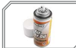
Z189 Air Filter Oil (Spray type)

Stronger and smoother shocks for increased durability and more consistent suspension performance.