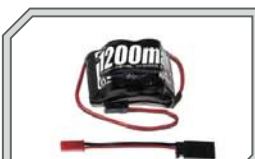
2012 Hump Battery Pack for Receiver (6v 1200mAh/Ni-MH)

Lighter weight to reduce overall kit weight and increase performance.