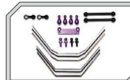
86290 Sway Bar Set

Stronger and smoother shocks for increased durability and more consistent suspension performance.