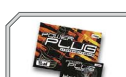
1502 Glow Plug Med R3 1503 Glow Plug Med Cold R4 1504 Glow Plug Cold R5

Rechargeable Ni-MH pack for longer run times.