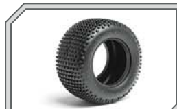
4410 Ground Assault Tire D Compound (2.2in/2pcs) 4411 Ground Assault Tire S Compound (2.2in/2pcs)

Featuring a modern tread design for racing on hard-packed dusty surfaces and a sticky yet durable compound.