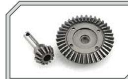
86336 Heavy-Duty Final Gear Set (P1x38T/P1x13T)

Because these clutch bells are machined from a single piece of high-strength steel, they are much stronger than standard two-piece clutch bells.