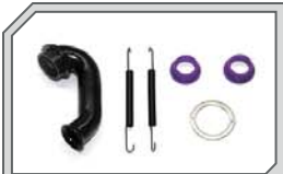
86162 Exhaust Header/Black/Short (Rear Exhaust Engine/U Shape)

High strength steel and chrome plated for extra durability.