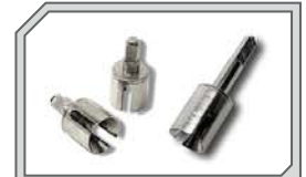
86312 Heavy-Duty Diff Shaft 5x26x7mm (Silver/2pcs) 86313 Heavy-Duty Gear Shaft 5x38x7mm (Silver)

Precision machined from special heat treated steel for a significant increase in drivetrain strength and extended maintenance intervals.