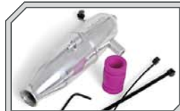
86161 MT 2 Aluminum Tuned Pipe

Performance header for rear exhaust engines.