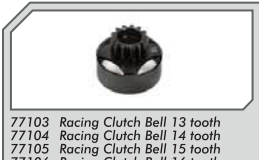
77103 Racing Clutch Bell 13 tooth 77104 Racing Clutch Bell 14 tooth 77105 Racing Clutch Bell 15 tooth 77106 Racing Clutch Bell 16 tooth 77107 Racing Clutch Bell 17 tooth 77108 Racing Clutch Bell 18 tooth 77109 Racing Clutch Bell 19 tooth

Aluminum clamp hubs are stiffer and more durable than the stock plastic parts, which delivers a more consistent mounting point for the wheels.