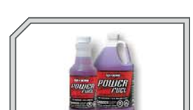
74318 HPI Power Fuel 20% (1 quart) 74320 HPI Power Fuel 30% (1 quart) 74348 HPI Power Fuel 20% (1 gallon) 74350 HPI Power Fuel 30% (1 gallon) Specially blended fuel for optimum engine performance and protection.