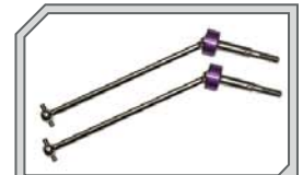
86301 HPI Universal Joint (Front) 86302 HPI Universal Joint (Rear)

Improves the stability and performance of your chassis. Includes front and rear with 3 levels of stiffness.