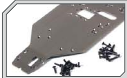
73948 Super Chassis 2.5mm (7075S / Gun Metal)

We offer a wide range of option parts to maximize the speed and performance of the Nitro MT 2 G3.0. Visit our website for a complete list of parts at www.hpracing.com