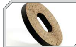
A844 Fiber Brake Disc

These easy to install machined aluminum hex hubs increase the total width by 24mm, giving the MT 2 G3.0 better traction around tight turns!