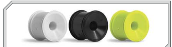
3090 Dish Wheel White 3091 Dish Wheel Black 3092 Dish Wheel Yellow

Now you can have power, strength and BLING in one shiny package. Designed to bring more power to the table and polished for great looks. This pipe fits the existing header.