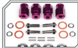
88055 Aluminum Wide Hex Hub 12x24mm (Purple)

Three springs are included to adjust how much the planetary diff gears engage, giving you control over the amount of traction or slip you have at either the front or rear of your vehicle.