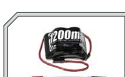
2012 Hump Battery Pack for Receiver (6v 1200mAh/Ni-MH)

This bodyshell is loaded with detail and molded in crystal clear polycarbonate materials so you can add your own custom paint job.