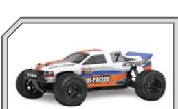
7130 Dirt Force Clear Body

Precut, predecated, preprinted, ready to go option body!