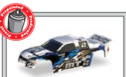
7761 Nitro MT-1 Truck Painted Body (Blu/Wht/Gry)

Precut, predecated, preprinted, ready to go option body!