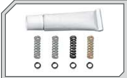
72215 Gear Diff Adjustment Spring Set (Medium, Firm, Stiff)

The Super Chassis is machined from a thick 2.5mm plate of aerospace quality 7075S aluminium, delivering increased chassis strength and rigidity for extreme driving conditions.