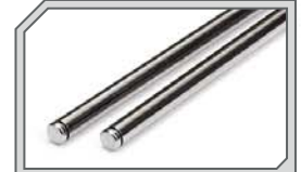
6286 Shaft 3x47mm (2 pcs) 6290 Shaft 3x35mm (2 pcs)

Delivers increased stopping power and less brake fade during long races. The heavy duty fiber disc can easily handle the extra load, and it's thicker than stock for extended life.