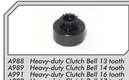
A988 Heavy-duty Clutch Bell 13 tooth A989 Heavy-duty Clutch Bell 14 tooth A991 Heavy-duty Clutch Bell 16 tooth A992 Heavy-duty Clutch Bell 17 tooth A993 Heavy-duty Clutch Bell 18 tooth A994 Heavy-duty Clutch Bell 19 tooth

Machined holes help keep the weight down for quick acceleration, and the holes also help keep the clutch shoes cooler for consistent performance.