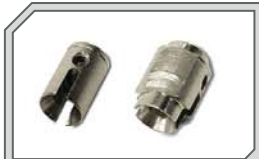
86314 Heavy-Duty Cup Joint 7x19mm (Silver)

High strength steel and chrome plated for extra durability.