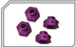
86300 Aluminum Hex Hub Clamp Type 12mm (Purple/4pcs)

The ultimate upgrade for increased smoothness, efficiency, and durability in your drivetrain.