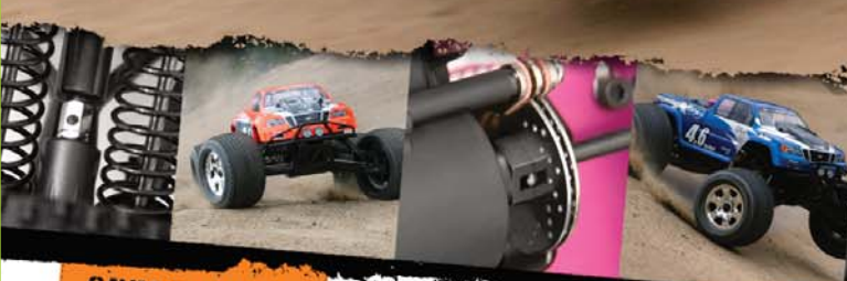
SAVAGE X SS 4.6