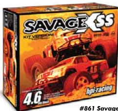
#861 Savage X SS 4.6

The Savage X SS 4.6 features our powerful Nitro Star K4.6 (.28 cubic inch) engine that pumps out 2.9 horsepower for a top speed of 44 mph and enough power to do wheelies on command! The powerful K4.6 engine has an anodized billet aluminum head to keep it cool even during extreme off-road driving, true ABC construction using a long-life chromed sleeve, an 8.5mm composite carburetor for high performance and improved high temperature tuning, and a pullstarter for easy starting. The entire drivetrain is equipped with heavy duty diff shafts and cup joints for strength and durability. To beef up the braking, our dual disc brake kit comes standard, featuring two vented stainless steel disc brakes and a machined steel brake hub. It's in kit form, not preassembled, so experienced R/C modelers can have the satisfaction of building it themselves. The kit does not include electronics, so owners can customize their Savage exactly how they want it. Step up to the speed, power and durability of a Savage X SS 4.6!